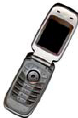
Fig. 2. Example of an unacceptable low-resolution image