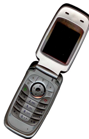
Fig. 3. Example of an image with acceptable resolution